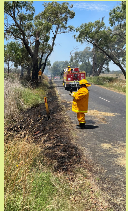
CFA volunteers from Moe South responding to a fire at Heartsridge Road, Traralgon East