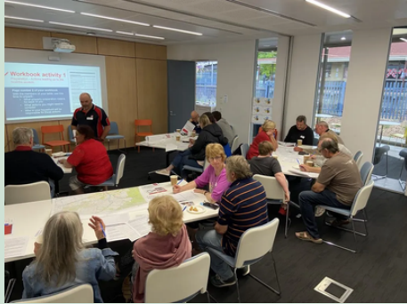
Bushfire Planning Workshops - Just one of the local CBBM ideas delivered

Later this year will mark the third anniversary of the Moe South CBBM project. From an idea and conversation which started during a Community Day at the CFA station back in 2019 we have seen the development of the program and can be collectively proud of all its achievements in its short time!