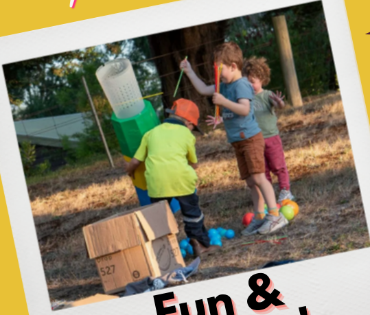
Fun & Games!